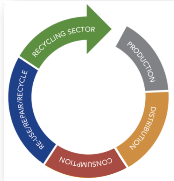
Figure 2: A circular flow of non-renewable resources.

that can supply new industrial cycles with high-quality raw materials. The main challenge becomes to husband resources in such a way that the benefits of modern (digital) technologies can be extended to the largest number of people as far as possible into the future.